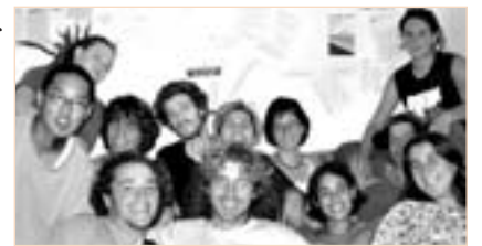
Berkeley Worms Cooperative Group

BW can be contacted at 510.643.0440 and compost@ocf.berkeley.edu , their website is www.ocf.berkeley.edu/~compost .