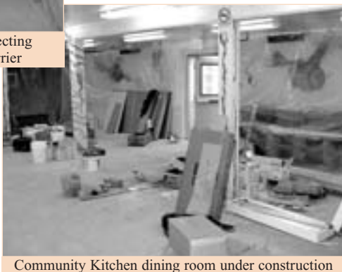
Community Kitchen dining room under construction