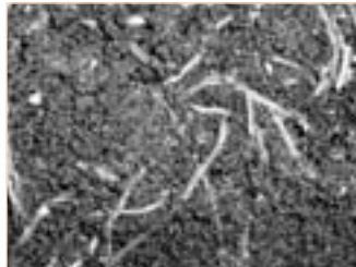
Eisenia foetida, "Red Worms" eating Community Kitchen Waste

We also talked with groups and individuals who have been using worm bins for many years. One of the groups we spoke with is Berkeley Worms (BW), a